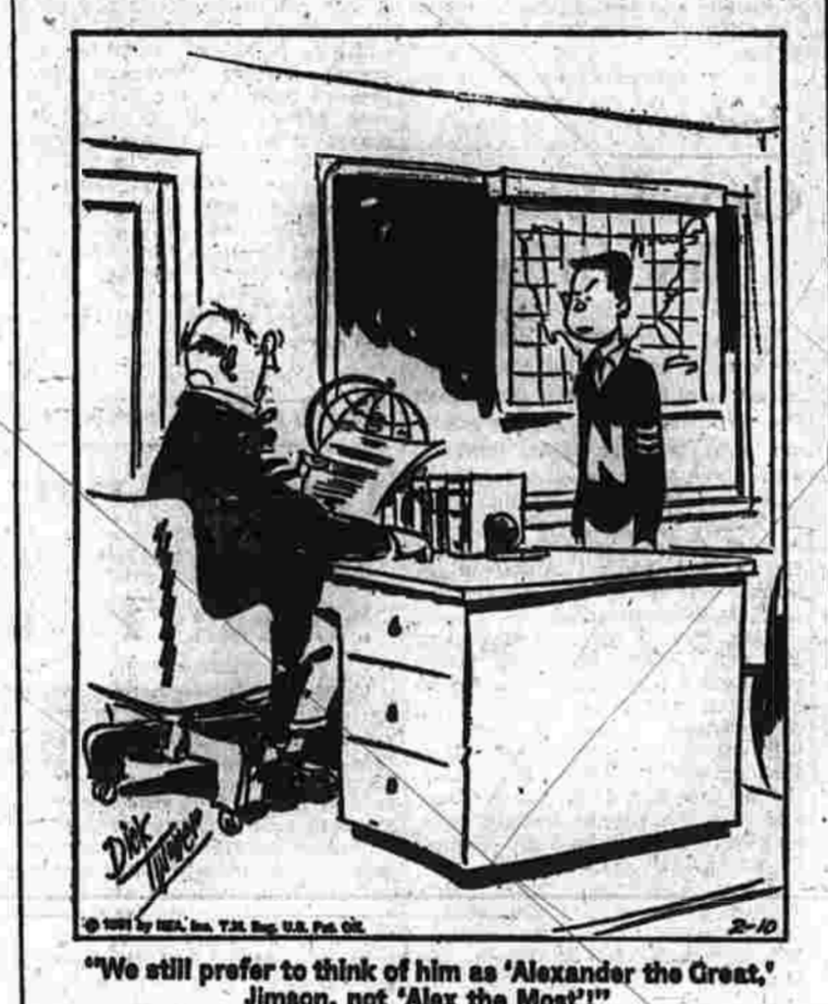
"We still prefer to think of him as 'Alexander the Great,' Jimson, not 'Alex the Hoop!'"